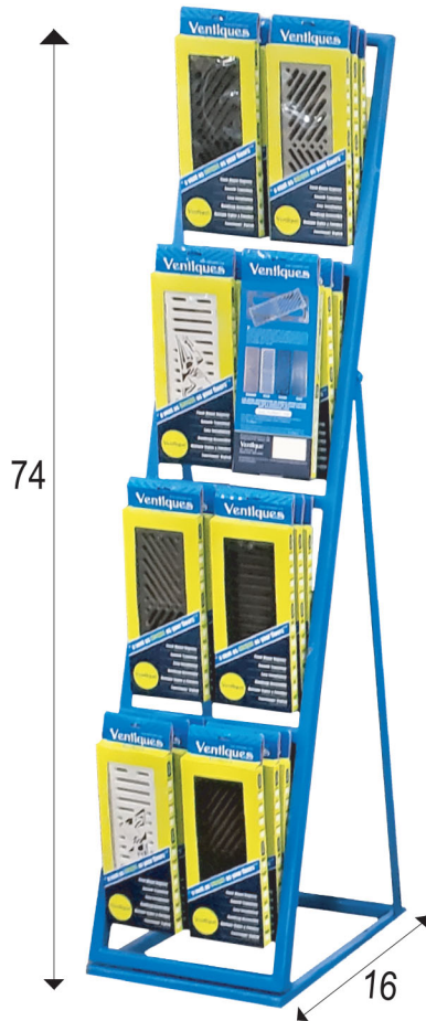
Metal Tower Rack

Our metal tower stand with its vertical layout, and tough metal design allows easy access to all of the styles and colors you are looking for. Standard size is 74"h x 16"w. This rack will hold up to 40 vents.